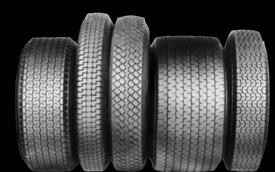
CR65 5 STUD R1 CR82 R5