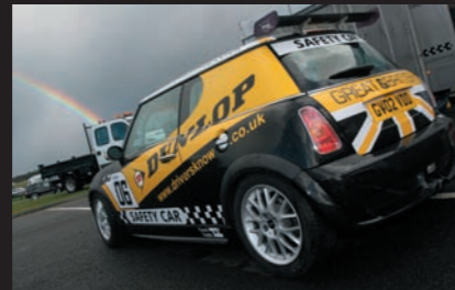
GREAT & BRITISH MINI