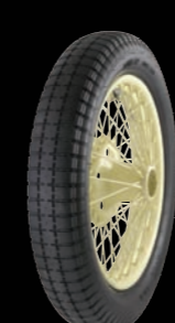
TRIPLE STUD ROAD RACE